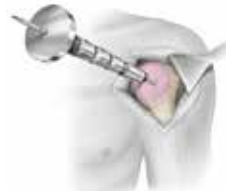
Impact the Humeral Cage Peg