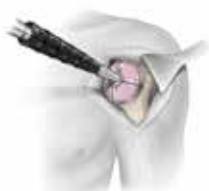
Ream the Humeral Head Over the K-wire