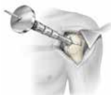
Place K-Wire Through the Cannulated Handle