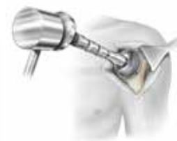
Impact the Resurfacing Humeral Head