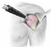
Drill the Humeral Cage Peg