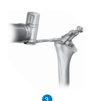
Resect the Tuberosity using the CTA Head Cut Guide placed over the Replicator Plate.