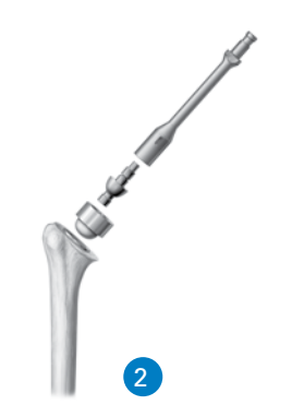
Attach Replicator Plate and Torque-Defining Screw.